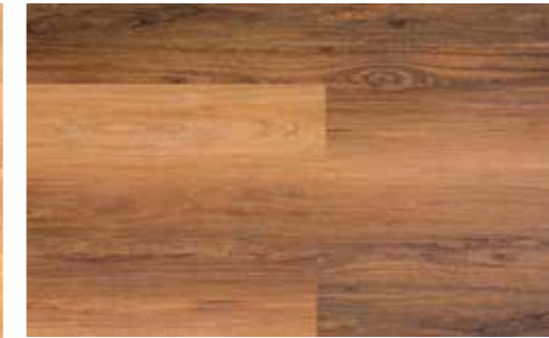
Stringybark Spotted Gum *WOODMIX ARN76802