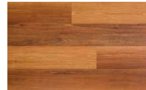
Coolabah Spotted Gum *WOODMIX ARN76804