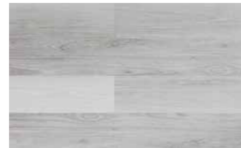
Ghost Gum Spotted Gum *WOODMIX ARN76810