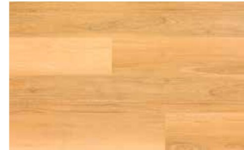
Mountain Ash Spotted Gum *WOODMIX ARN76813