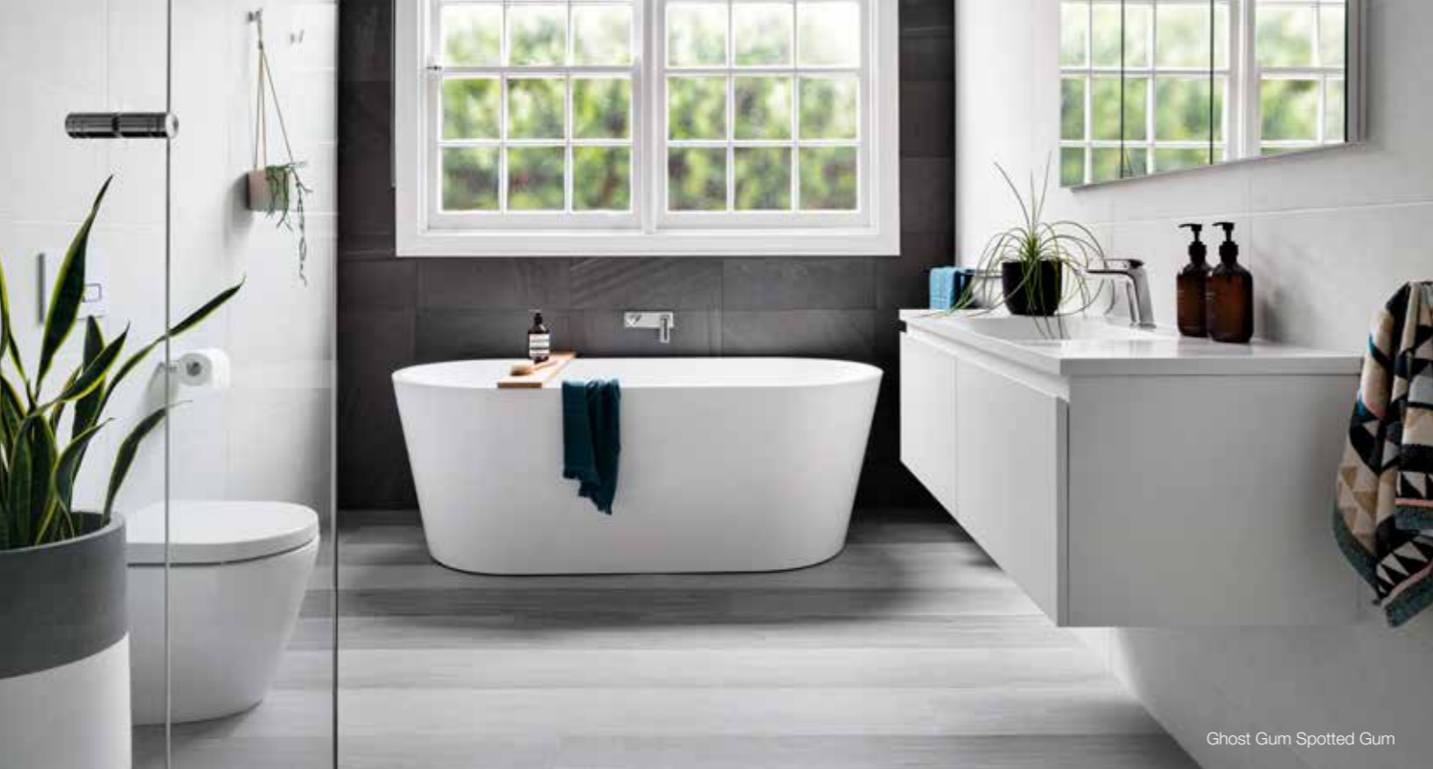
Ghost Gum Spotted Gum