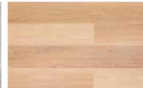
Manna Gum *WOODMIX ARN76812