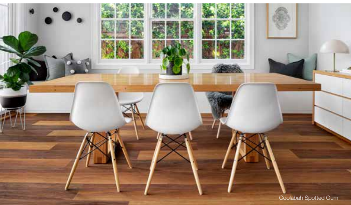
Coolabah Spotted Gum

Signature Floors® MicroGard® is an excellent antibacterial and antifungal treatment making polymers resistant to microbial growth.