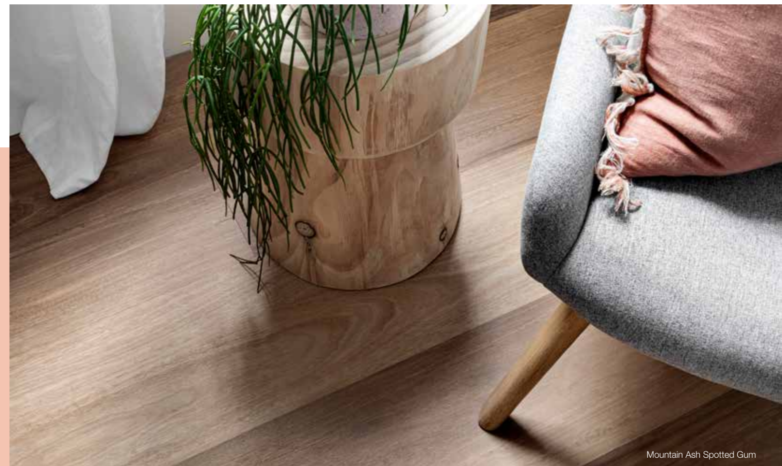
Mountain Ash Spotted Gum